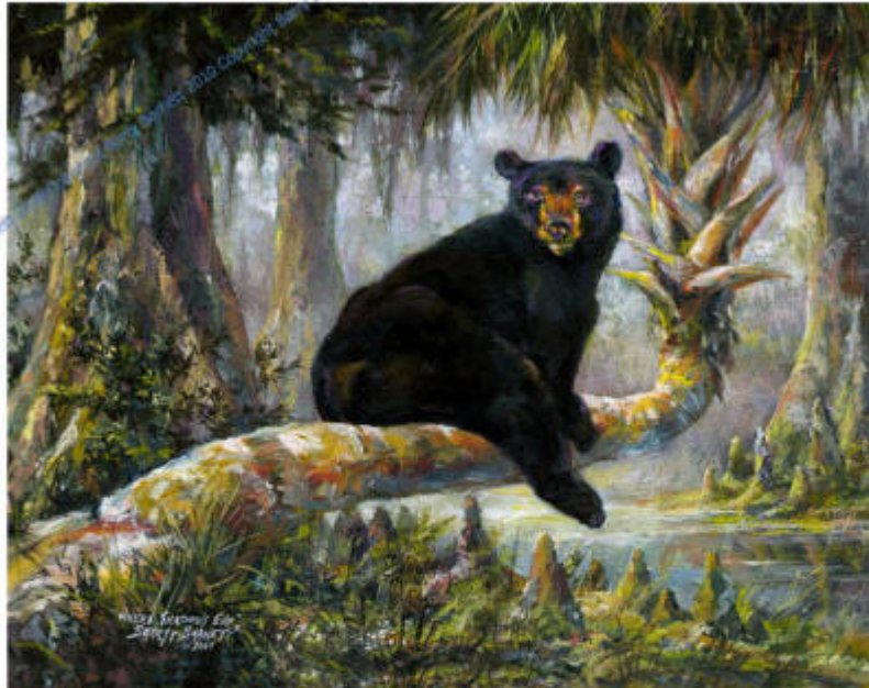
"Where Shadows End"/Blue Creek, Astor, Florida Barry Barnett/Artist International

Where Buck's Trail fades into the backwater of Blue Creek tall cypress rise up from amber shallows. These silent sentinels are host to a canopy of Spanish moss entwined in curtains of emerald green laced with deep purple. Here the Florida black bear is the master of shadows. Occasionally the sun will reveal a domain where shadows end and a black bears mischief begins.